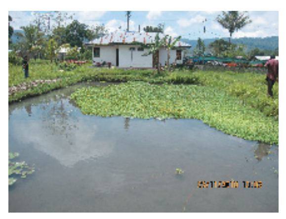
Picture 2:A weed-infested demonstration fish pond in the backyard of Ermera District Agriculture Office

A brief meeting was organized with the Ermera District Agriculture Office, which is mandated to provide agricultural extension services ranging from crops to livestock and aquaculture. However, the office lacks expertise in aquaculture extension. It generally solicits help from the hatchery at Gleno, should there be the need to provide technical advice to fish farmers. The District Agriculture Office also has a few fish ponds which are being used as demonstration ponds. Most of the ponds however seemed eutrophic in nature, reflecting poor management due to lack of technical expertise in fish pond management.